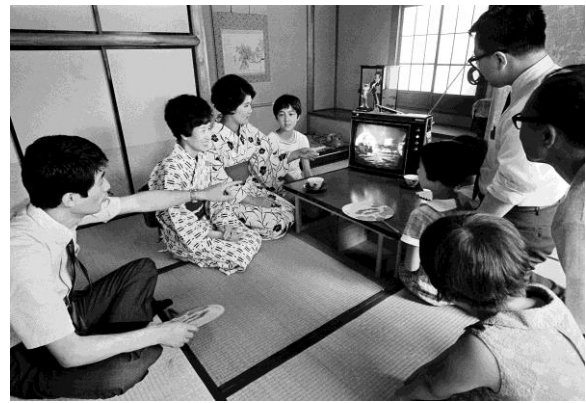
Family in Tokyo watches live broadcast of Apollo 11 Moon Landing, July 21, 1969.

2000: The Digital Video Disc (DVD) is introduced.