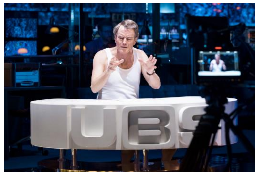
Bryan Cranston as Howard Beale, Belasco Theatre, 2018.

Historically, television has not always prioritized telling diverse stories, and we can see that through what stories are told and who is telling the stories. Network , as a piece of media criticizing media, depicts a news network who turns to more and more sensationalism and commentary to drive ratings up and secure financial success at the expense of a factual news report. As the show progresses, an idea of a weekly show showcasing stories about terrorism from the point of view of terrorists starts off as a joke, but becomes a reality. As Howard begins to say racist rhetoric about people from the Middle Eastern diaspora, it becomes clear that the network's criteria for success is tied to ratings, and not ethics or potential lawsuits.