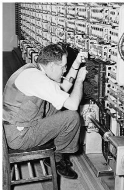
Alan Turing, circa 1930s.

A brief timeline of computers, televisions, The Digital Revolution, and the rise of the Information Age. This is an abridged version of a complex history that spans over 200 years.