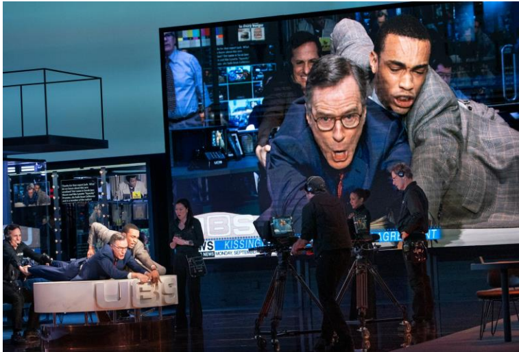
Bryan Cranston and Broadway cast of Network , 2018.