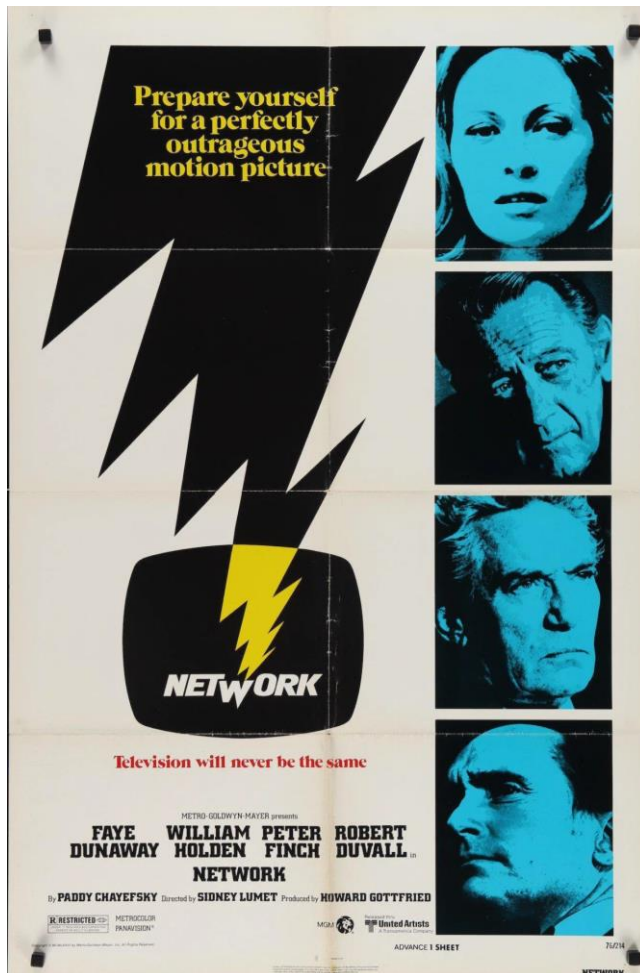
Vintage film poster for Network, 1976.

The film, Network , was directed by Sidney Lumet and written by Paddy Chayefsky. Upon its release in 1976 it met critical success, earning a total of 10 Academy Award nominations. It won four Oscars, including Best Actor (which was awarded posthumously to Peter Finch –who was the first posthumous winning actor), Best Actress (Faye Dunaway), Best Supporting Actress (Beatrice Straight), and Best Screenplay (Paddy Chayefsky –this was his third Oscar for screenwriting after winning for Marty [1955] and The Hospital [1971]). The script has been praised as a satirical criticism the decline of television and “honest reporting.”