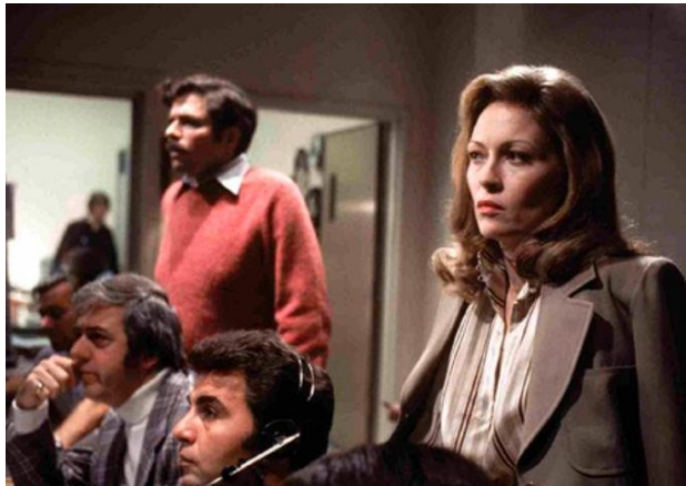
Faye Dunaway as Diana Christiansen in Network, 1976.

As television was coming of age, so was television news. Just as the first programs came from radio, so did the first newscasters. Edward R. Murrow, who gained his reputation as a "newsman's newsman" for his coverage of Europe on CBS Radio during World War II, took his talent, and many of his colleagues, to television in the 1950s.