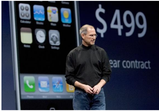
Apple CEO, Steve Jobs, presents the first iPhone at Macworld on January 9, 2007.

2001: NTT DoCoMo launched the first 'smartphone' that linked to a 3G network on October 1 st in Japan.