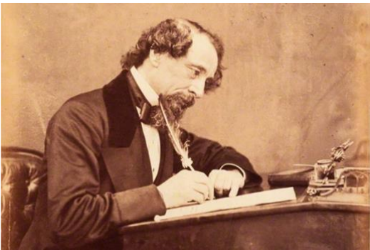
Charles Dickens

Charles Dickens was born on February 7, 1812, in Portsmouth, England to John and Elizabeth Dickens. The Dickens family lived in relative comfort supported by John's work as a naval pay clerk throughout the early years of Charles' life. John Dickens had difficulty managing the family finances and, in 1824, he was sent to Marshalsea Prison for his debts.