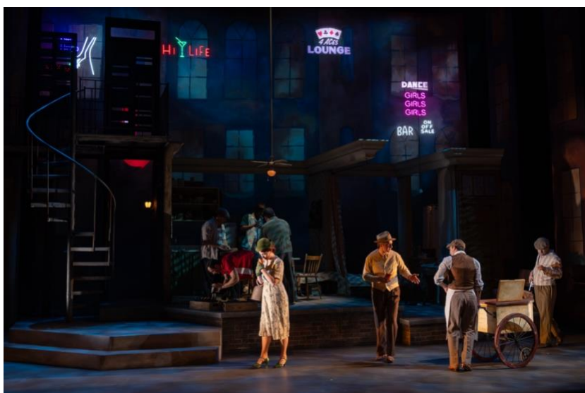
Emily Howard is in the Ensemble