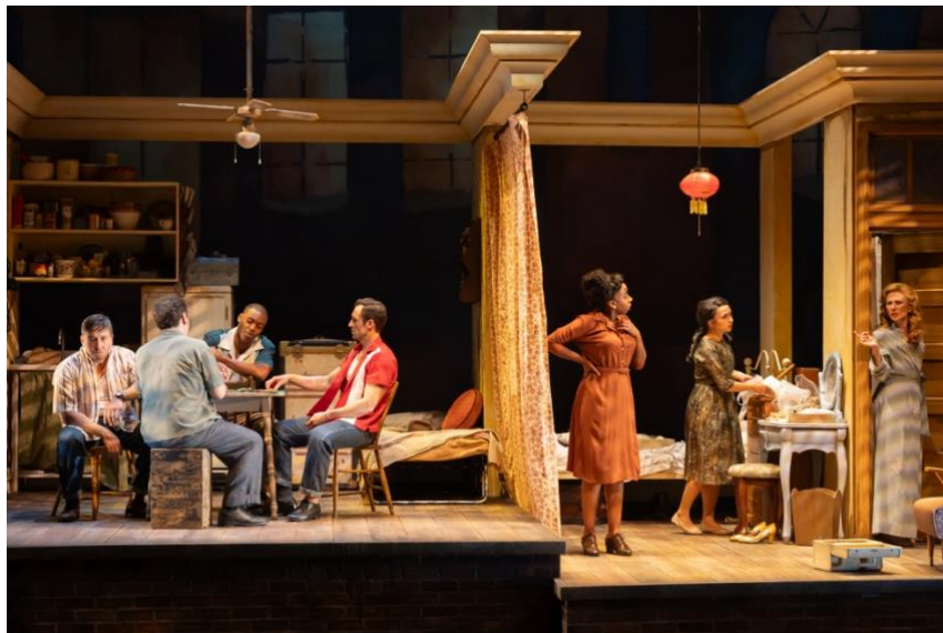
for The Citadel Theatre's production of A Streetcar Named Desire (2024), produced in association with Theatre Calgary, featuring the cast of A Streetcar Named Desire