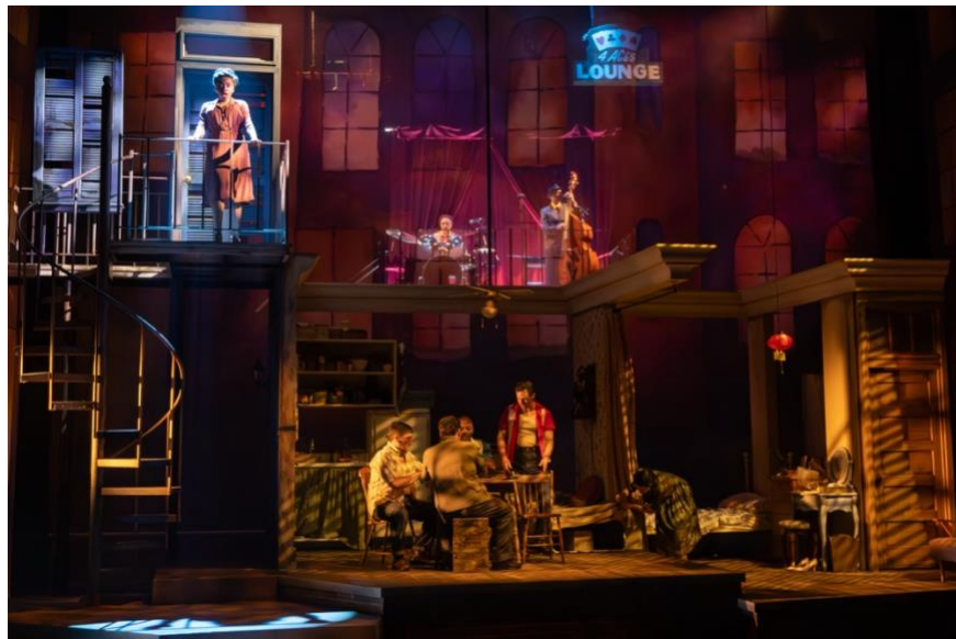
Photo by Nanc Price for The Citadel Theatre's production of A Streetcar Named Desire (2024), produced in association with Theatre Calgary, featuring the cast of A Streetcar Named Desire