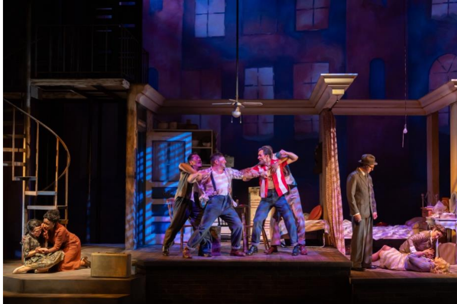
Photo by Nanc Price for The Citadel Theatre's production of A Streetcar Named Desire (2024), produced in association with Theatre Calgary, featuring the cast of A Streetcar Named Desire