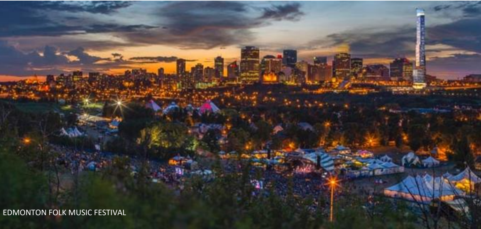
EDMONTON FOLK MUSIC FESTIVAL